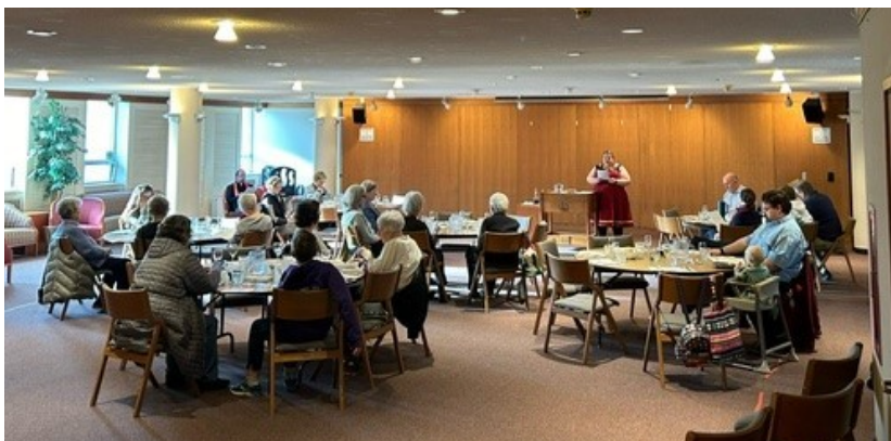
Maudy Thursday service and meal in Centennial Hall

Also, if I didn't mention your group, please let me know. I am happy to feature any and all of our groups and committees. You are what make St. James, St. James!