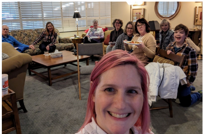
Joan of Arc Discussion Group